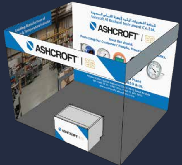
Graphically Enhanced Shell Scheme

Enhance Shell Scheme Option A with additional graphic design as per your requirements. All the printing of wall panels, fascia including logo is included.