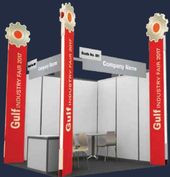
Standard Shell Scheme

This option includes white wall panels, carpet tiles, fascia board, round or square table, meeting chairs, fluorescent tubes, system counter, one 13 amp single-phase power point and wastepaper basket.